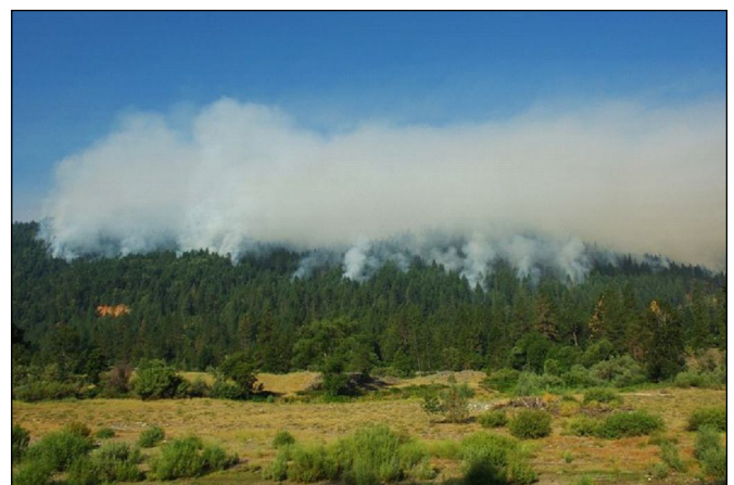
The above photo was taken on July 21st, 2008, about 8 miles west of Weaverville, California on State Hwy 299. This fire was part of the "Iron Complex".