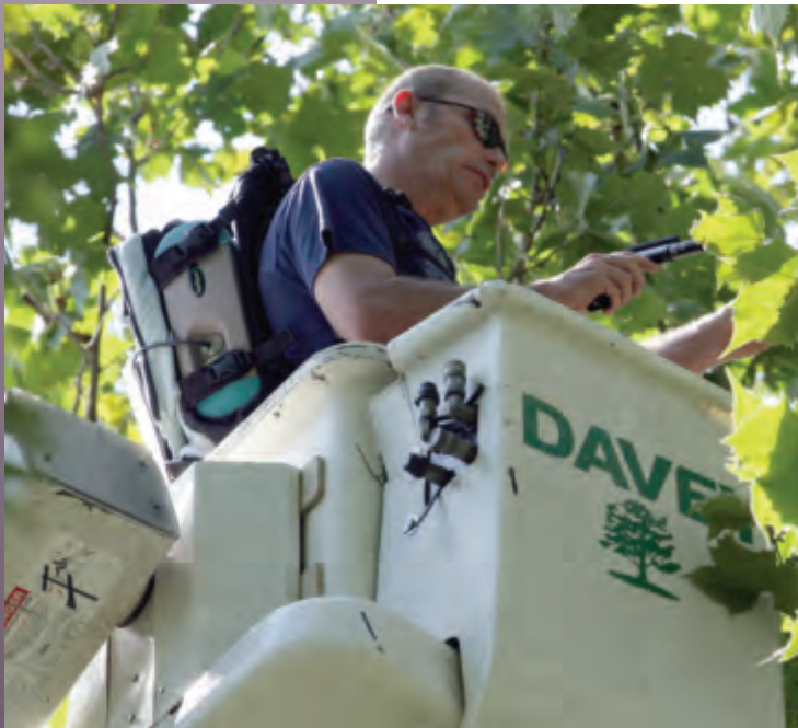
Figure 1. In field handheld spectrometer data collection.