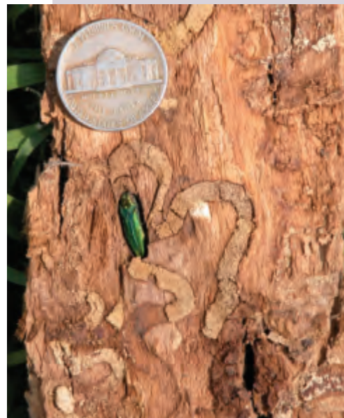
Figure 2. Adult emerald ash borer in larval tunnel. (Photo courtesy of Eric Day, Virginia Tech, Department of Entomology).

NCDC Imaging contracted with Terra Remote Sensing Inc (TRSI) out of Sydney, British Columbia, Canada for the acquisition of 1-meter resolution narrowband (5nm) hyperspectral imagery and accompanying lidar over the City (95 square miles). The Terra Remote Sensing collection system provides a single platform capable of simultaneous collection of both HSI and lidar data sets. Terra Remote Sensing and their mission partner at the University of Victoria processed the lidar and HSI data for the follow-up analysis by NCDC and SRA.