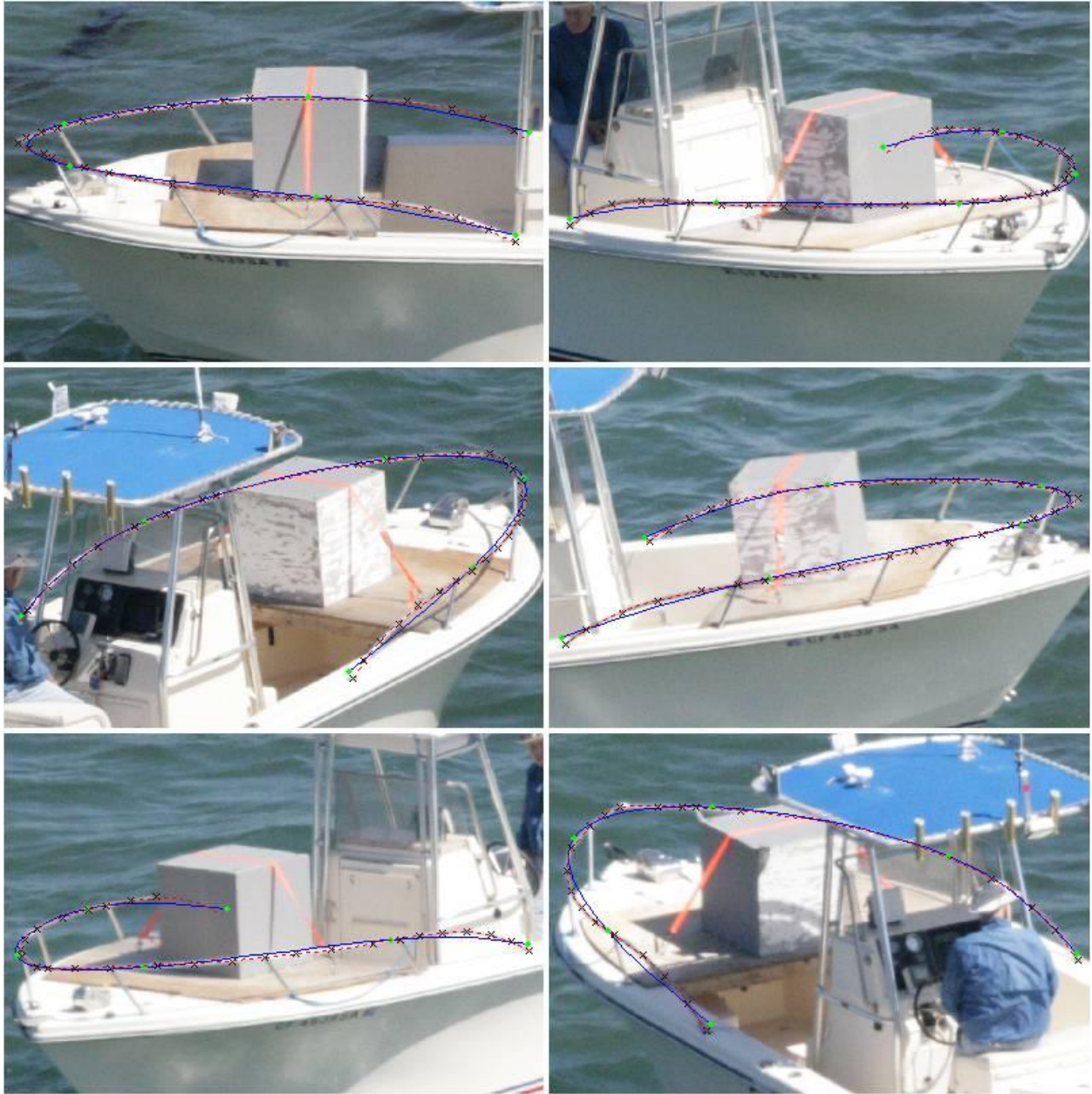
Figure 5. Natural cubic spline (blue) with 6 control points (green) derived from 172 observations across six images, and a Hermite spline (red) with 6 control points (not shown).

This curve represents a good example of a feature that is modeled well by a Hermite spline using relatively few control points. Hermite splines are very flexible due to their unconstrained tangents at the control points, however the large number of free parameters requires a separate adjustment to maintain stability. The natural cubic spline, on the other hand, is not able to match the curve as well as the Hermite for the same number of control points, due to its constrained tangents, and reduced flexibility. An attempt was made to increase the number of control points for the natural cubic spline to see if a better match could be made when there are more control points, however, the best solution that could be obtained was using 10 control points (the natural cubic spline with 10 control points yielded a mean residual of 1.8 pixels, and a maximum residual of 6.5 pixels). The results from the large spline are summarized in Table 3.