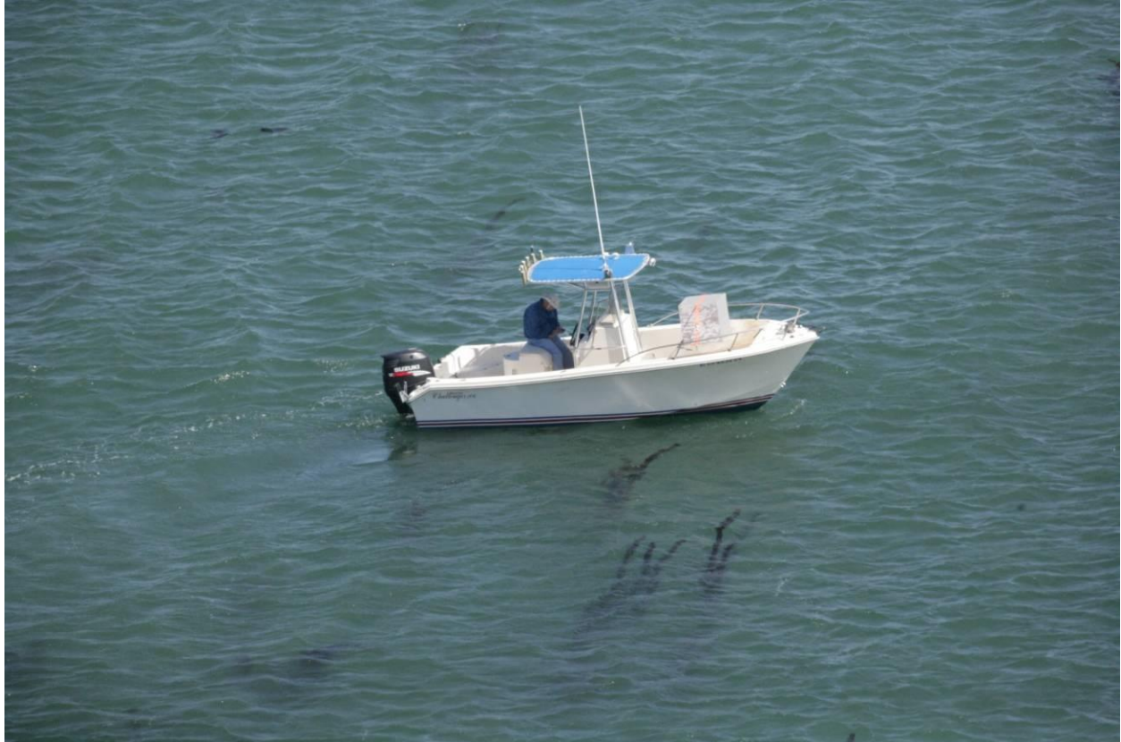
Figure 3. An example image from the vessel data set, taken with a Canon 1Ds Mark II and a 800 mm effective focal length lens at a range of approximately 370 meters.