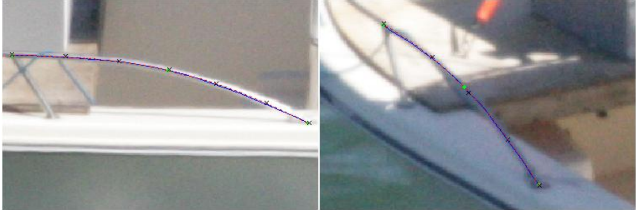
Figure 4. Results of simple spline triangulation from 5-6 observations in each of 6 images for both a natural cubic spline (blue) and a Hermite spline (red).

In order to test the method with a more complicated curve, a set of observations was collected along the whole railing, from the left (port) side around the front to the right (starboard) side (172 observations total). Several points were corresponded between images (the points where a vertical railing ties into the railing) as explained above and the spline was initialized using four control points in the interior (six control points total including the ends). Triangulation was then performed using a natural cubic spline. The resulting spline yielded fairly high residuals (mean residual of 3.3 pixels, maximum of 17.5 pixels). Due to the rather high residuals, triangulation was attempted again using separate adjustment; the residuals from the separate adjustment were slightly higher (mean residual of 5.0 pixels, maximum residual of 19.4 pixels) than for the first adjustment. Triangulation was also done using a Hermite spline and the natural cubic spline as an initial value. The results from this step were considerably better (mean residual of 1.1 pixels, maximum of 5.4 pixels). A comparison of the natural cubic and Hermite splines are shown for the curve in Figure 5.