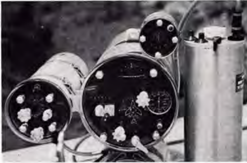
FIG. 8. The Pegasus instrument panels. Left—intervalometer; center—the navigation and altitude gyro panel.

by the fact that visibility, even in the clearest water, is limited to a few hundred feet at most.