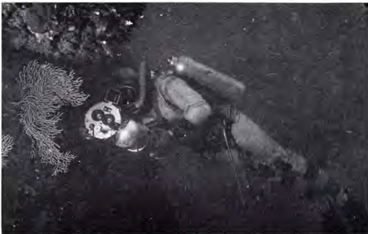
FIG. 6. Dimitri Rebikoff's first photogrammetric camera with double corrector lens and strobe "torpedo" in 1952. Depth—110 feet.

Pegasus is a long, thin, torpedo-shaped, aluminum marine machine, the final result of many years of evolution in undersea engineering. It is "flown" just like an airplane by stick and rudder precisely controlling pitch, roll, and yaw. The underwater pilot-diver has a complete instrument panel with artificial horizon, gyro compass, depth meter, and propeller revolution log, all made necessary