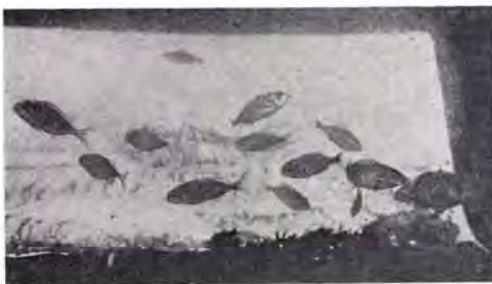
FIG. 3. The snapshot that resulted from the apparatus shown in Figure 2.

from the boat too heavy and cumbersome. This, too, is still valid today.